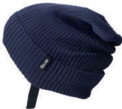
Special Order only MARINE