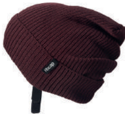
Special Order only BORDEAUX