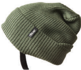
Special Order only KHAKI

extra large ø 62-65cm (only for grey and anthracite)