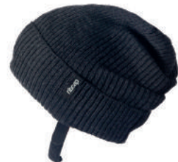
Special Order only ANTHRACITE