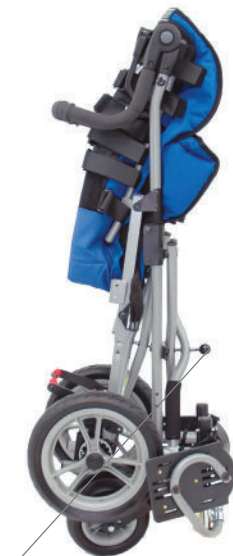
• Closure Bar