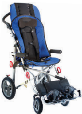
(Zippered Pockets in Cordura Seat & Back Upholstery)