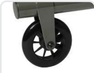
4" (7.6cm) fixed rear casters allow for easy access and keep the tray secure