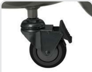
3" (10cm) front swivel casters lock